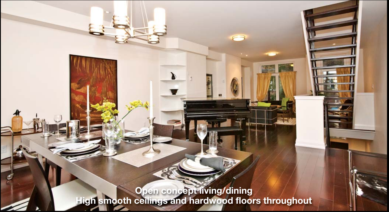
Open concept living/dining High smooth ceilings and hardwood floors throughout