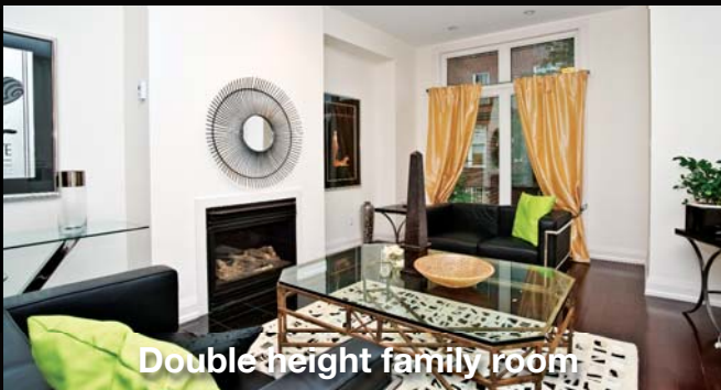
Double height family room