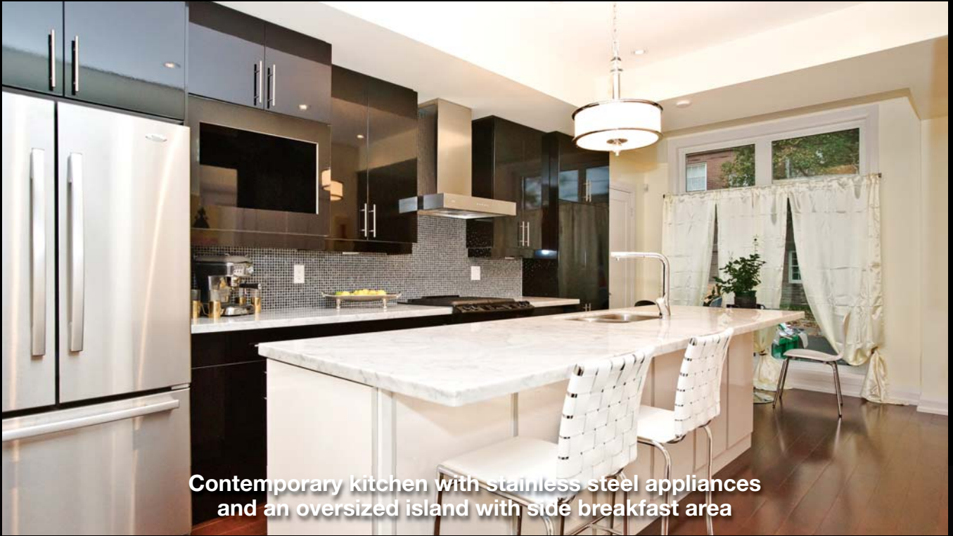
Contemporary kitchen with stainless steel appliances and an oversized island with side breakfast area